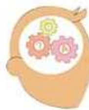
Critical Thinking Skills