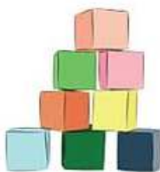
Problem Solving Skills